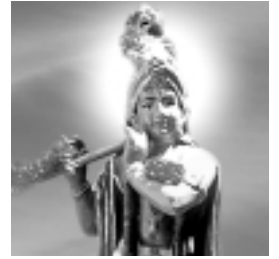
'Lord Krishna, the Presiding Deity, will take care of the growth and administration of the Ashram'

for the Inauguration of the new Sivananda Ashram in Orleans France